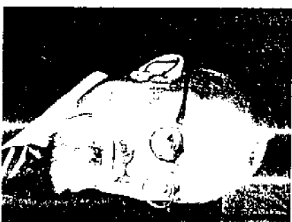
Rabbi Joseph Soloveitchik

With the advent of the ecumenical thrust of the Catholic Church in the 1960s, the Rav was consulted regarding Orthodox participation in the dialogue initiated by the Vatican with Jewish leaders. Rabbi Soloveitchik opposed many aspects of this dialogue. He held that there could be no discussion concerning the uniqueness of the respective religious communities. Each, he held, was an individual entity which could not be merged or equated with the other, since