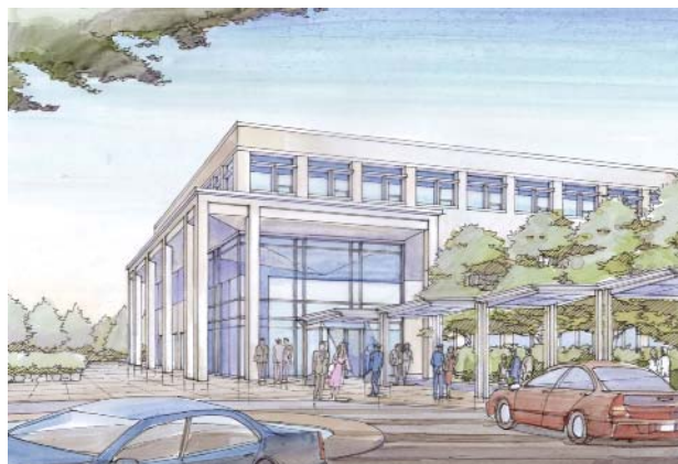
The MITRE Corporation is developing a new state-of-the-art campus center at its Bedford facility to be built according to a comprehensive energy plan and green building standards. With assistance from an MTC grant, the project will incorporate 16.5 kW of rooftop photovoltaics and 12.5 kW of advanced semi-transparent solar photovoltaic panes installed on a covered walkway.

recently adopted Federal Education Bill, schools and states stand to lose billions of dollars in federal funding if students do not perform well on annual standardized tests. School and university systems should consider adopting whole building green design at the LEED Gold level or corresponding MASS-CHP scoring as a standard requirement in new school design and school retrofits.